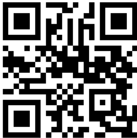
Figure 1: Scan QR code, go to the webpage